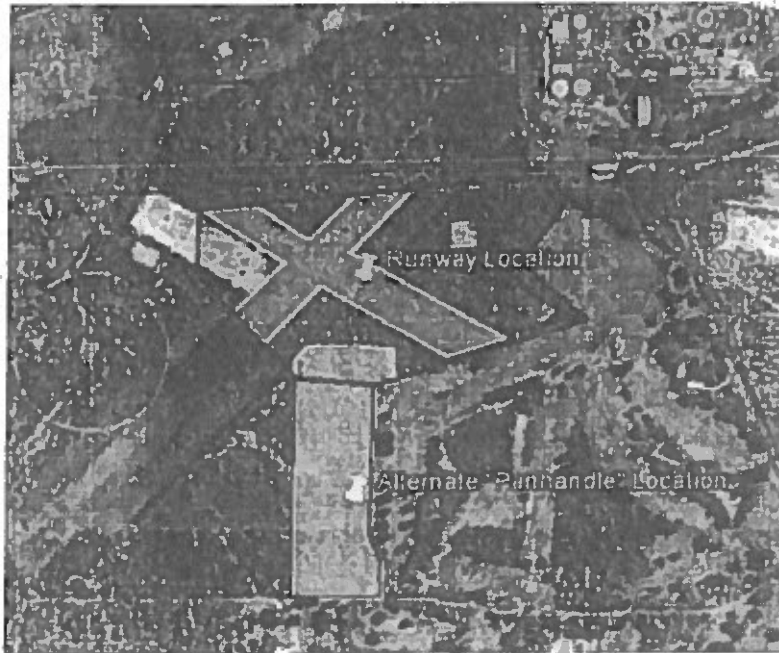
Figure 1: Alternatives Considered

The proposed undertaking for development of the "Kalaeloa Renewable Energy Park" includes installation of the following ( ground-disturbing activities identified in italics ):